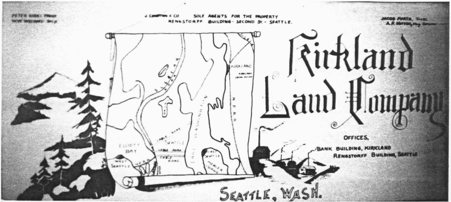
An 1890's vintage Kirkland Land Company Business card.

KIRKLAND HERITAGE SOCIETY 10635 NE 120th Kirkland, WA 98034