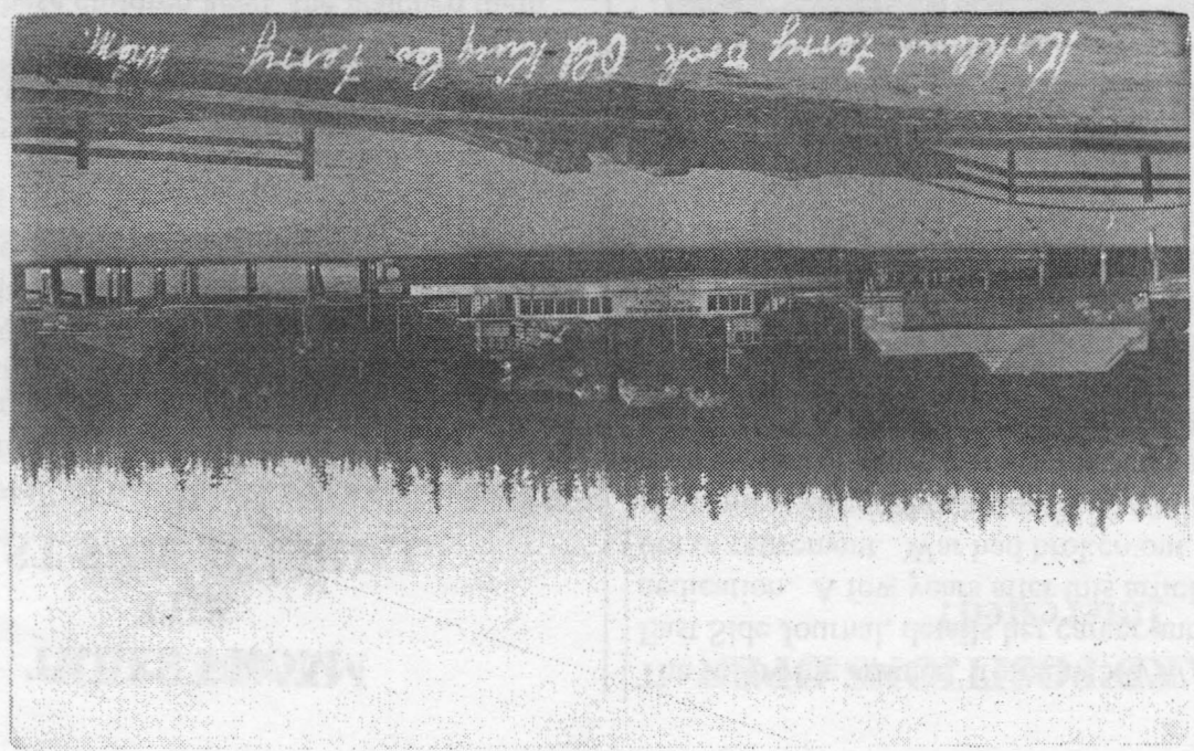
The King County Ferry Dock at the Kirkland Ferry Dock