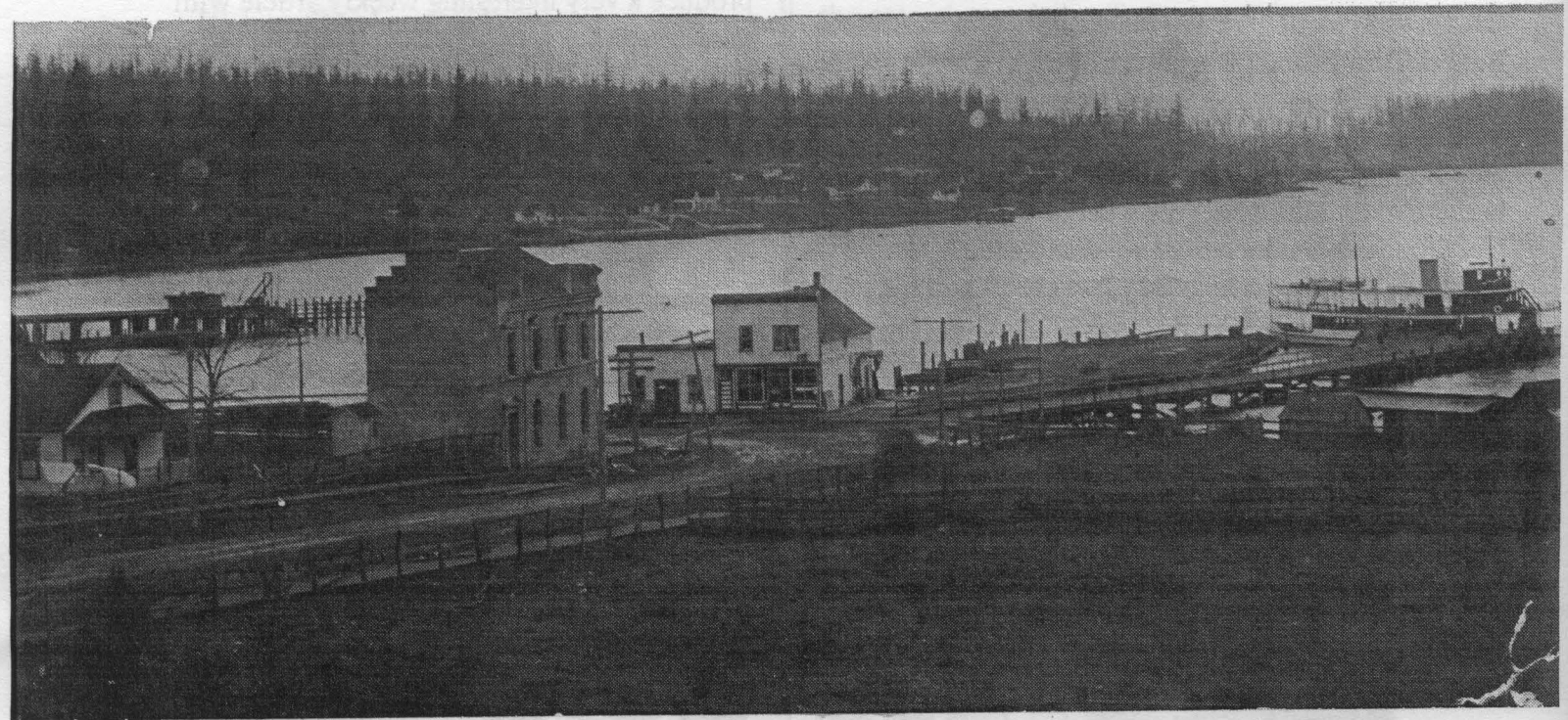
View Down Market Street Toward old Bank Building and Dock.

The franchise document directed that the railway line must run from this point down Market Street to Lake Avenue (photo below -old State Bank building was on that corner with the dock across the street) and "along Lake Avenue in a north easterly direction" to where that meets Picadilly Avenue (this would be the general location of Central Way). Also, a line was to run north on Market to the city limits and "along the whole of Spring Street" (today's 11th Ave. W.).