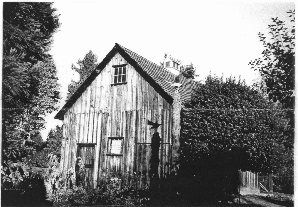
OSTBERG BARN Built 1905

The Journal of the Kirkland Heritage Society