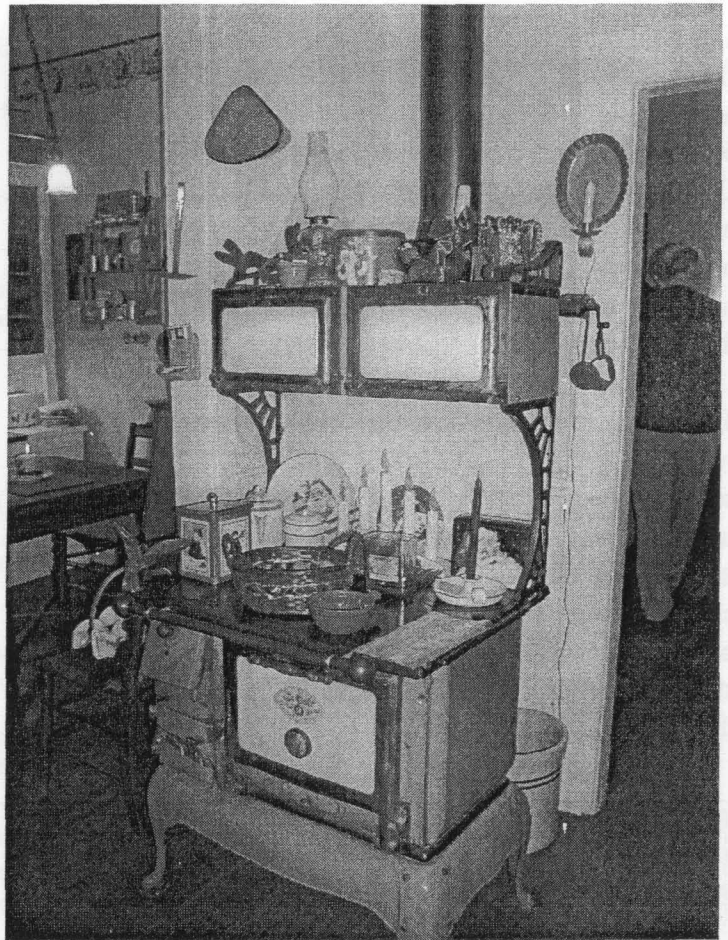
Antique Stove in Creger House